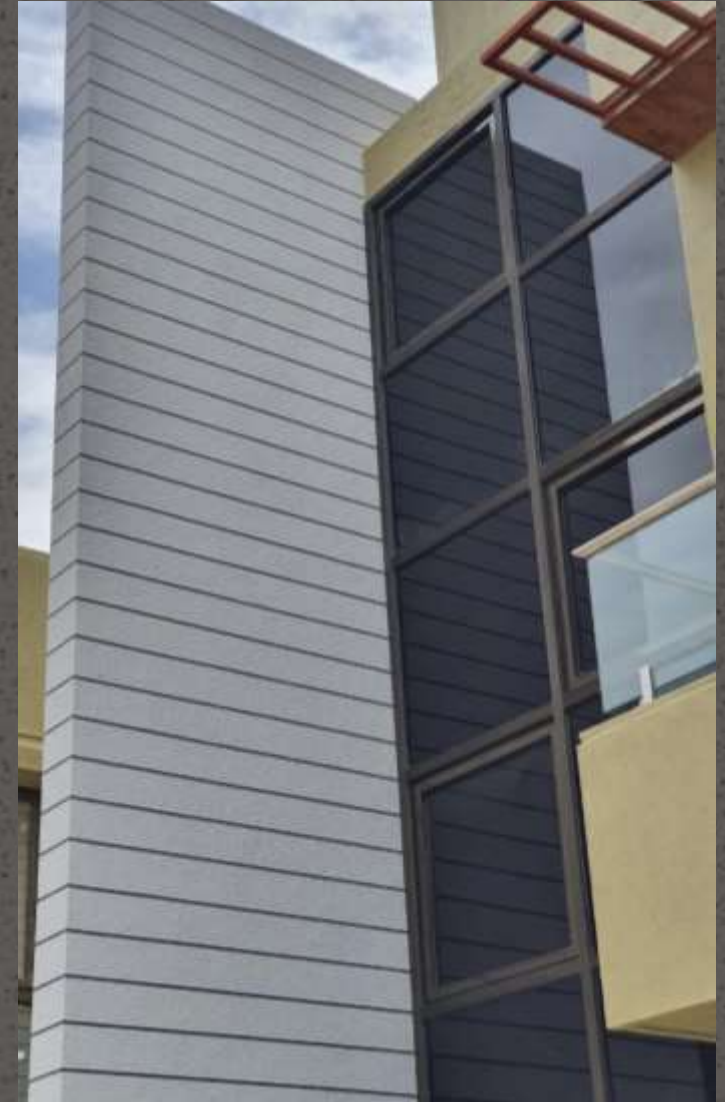
Facade – Compound Wall - Columns